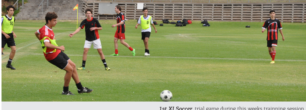
1st XI Soccer, trial game during this weeks trainning session