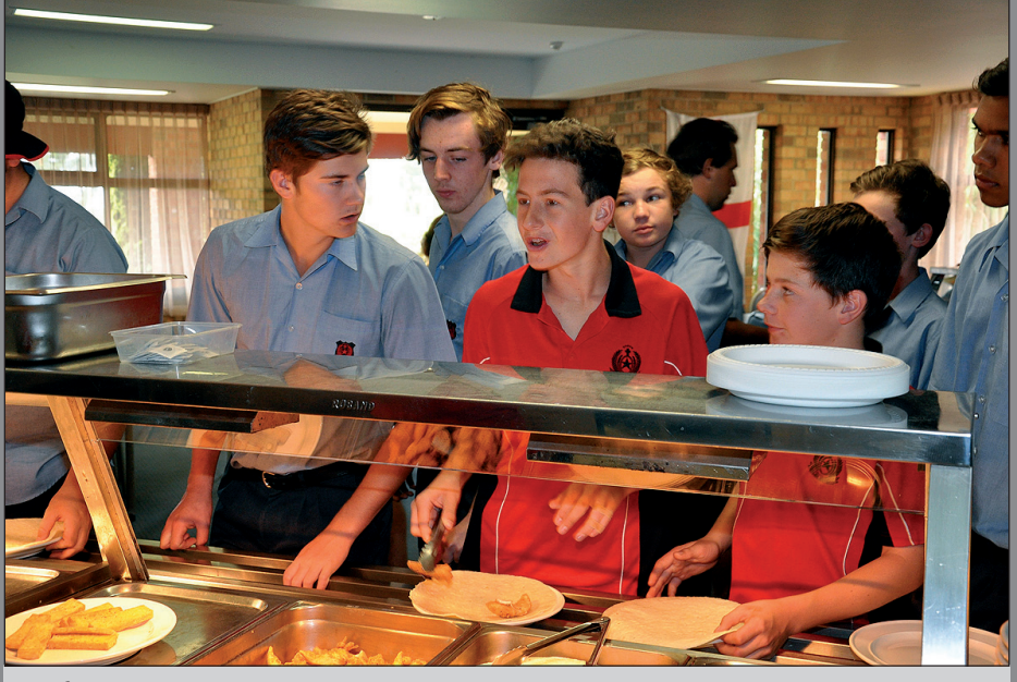
Lunch time at Duggan House