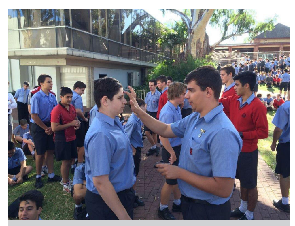
Valley Ceremony, Last Year's Ash Wednesday Ceromony