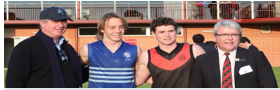
First XVIII Football, Principals and Captains together after the game on Saturday.