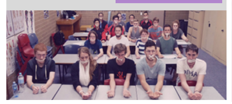
FREE OF CHARGE!