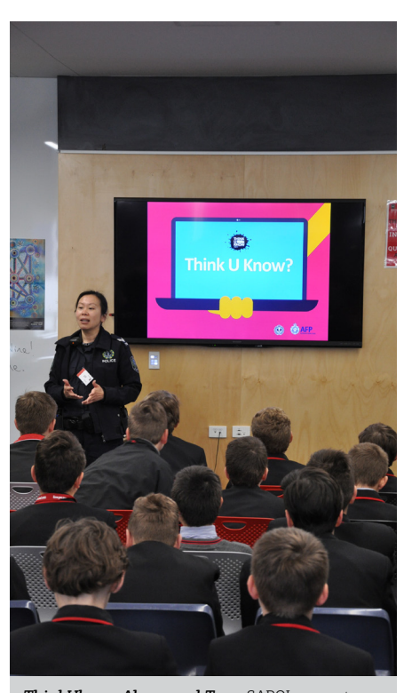
ThinkUknow Above and Top - SAPOL present ThinkUknow to year 5-9 Students, with a parent presentation last Wednesday