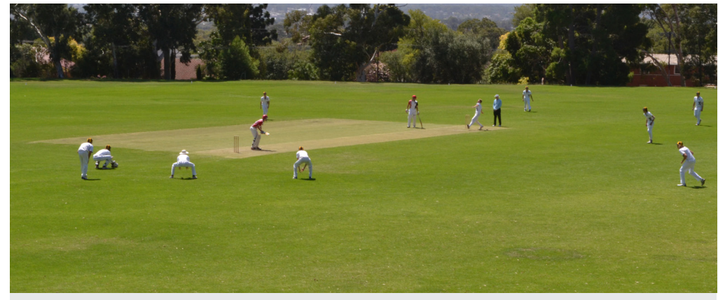
First XI, A younger First XI is showing some promising signs leading into next year's competitions