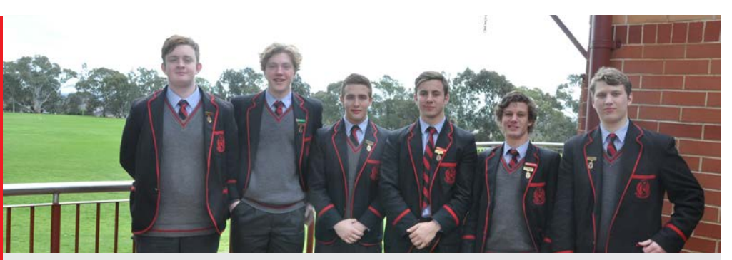
Year 11 Captains, casting an eye to tomorrow's leaders and 2017 Prefects