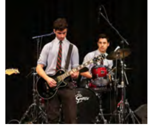
Music Night